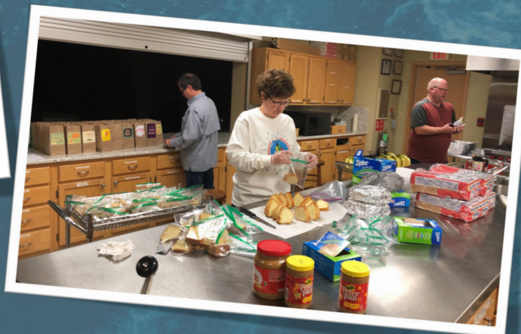
Pictured above: The delicious pork leftovers from our volunteer luncheon fed 30 boys in the basketball program.