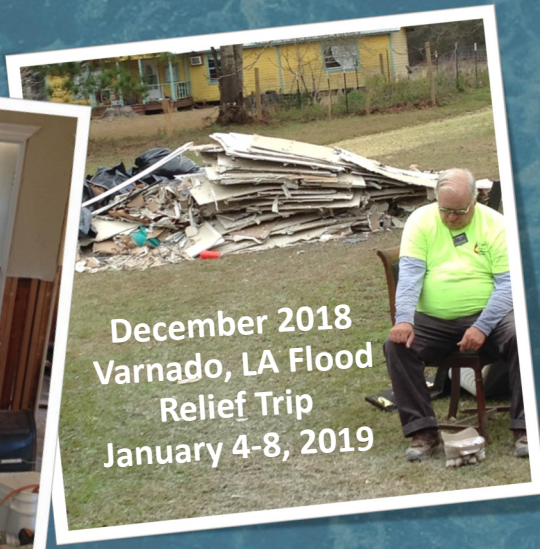
December 2018 Varnado, LA Flood Relief Trip January 4-8, 2019