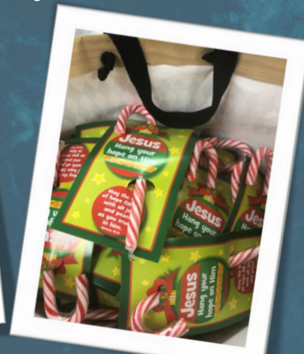
Left: Our Benton UMC Children's Ministry love on those on the Souper Saturday route by making a candy cane message that said, "Hang your hope on Jesus." What a sweet way to share God's love!